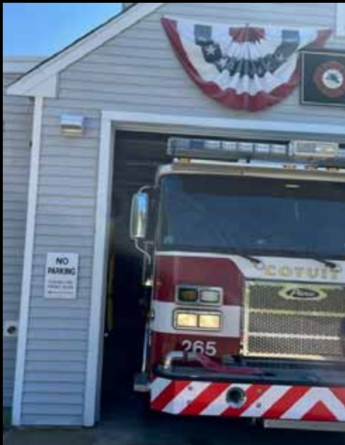
Custom Built Engine to Fit Current Doors

Unable to Accommodate Modern Fire Apparatus Current bay doors standards are 12' x 12' to 14' x 14' Existing bay doors are 9'11" high by 10' 11" wide