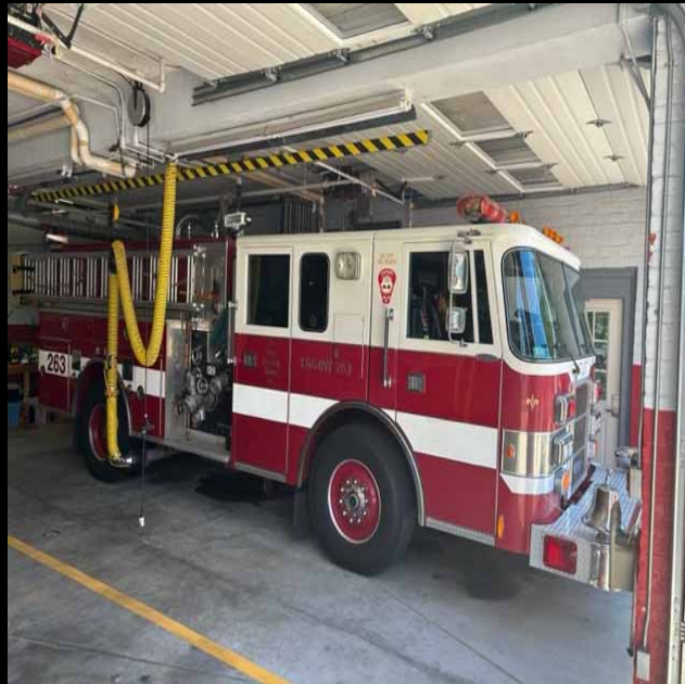
1994 Engine unable to be fully equipped due to height limitations