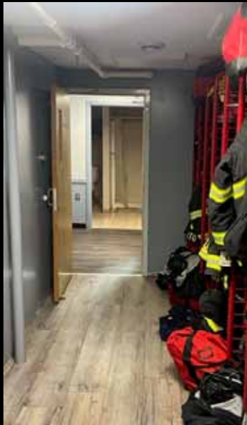
Access to decon through clean space