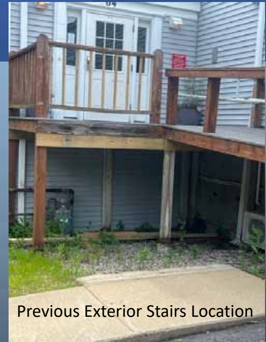
Previous Exterior Stairs Location