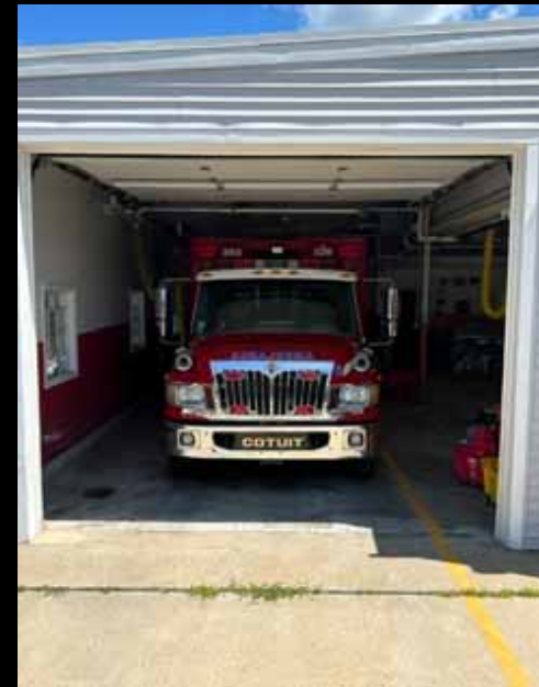
Interior utilities further restrict clearances