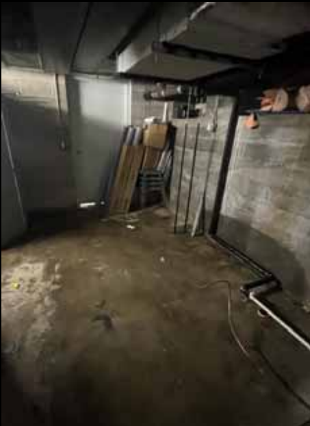
Storage room flooding caused by HVAC system