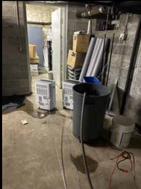
Dehumidifiers, buckets, and sump pumps to address water issues