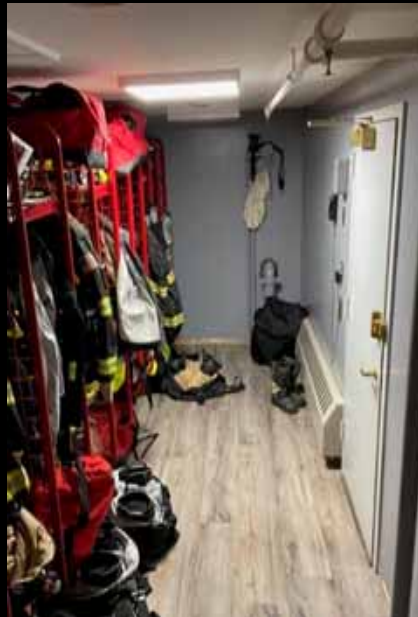
Inadequate storage space for PPE