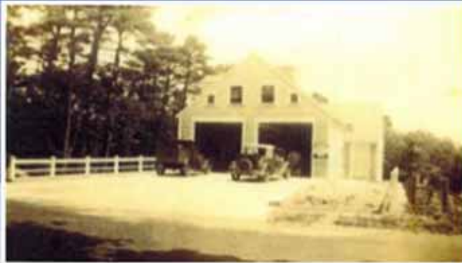
New Firehouse Circa 1938