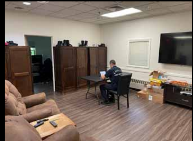
Uniform/personal lockers in combined training and day room