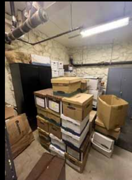
Fire District records retention area also has water infiltration