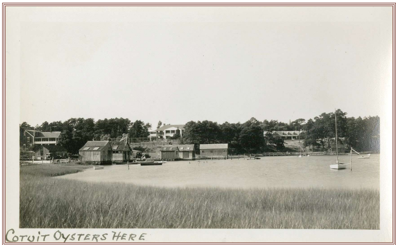
COTUIT OYSTERS HERE